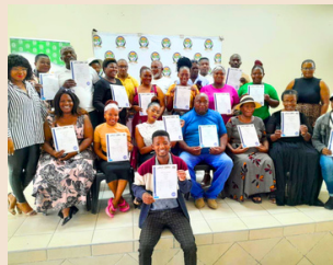
HANDOVER OF SANRAL CERTIFICATES