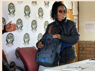
ADOPT A CHILD