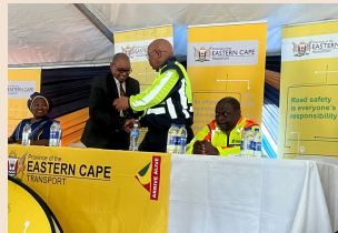
EASTER ARRIVE ALIVE LAUNCH