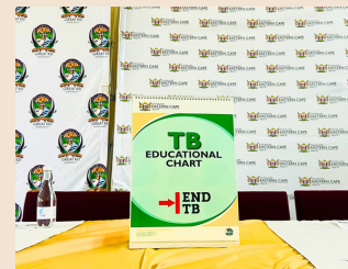
TB AWARENESS DAY