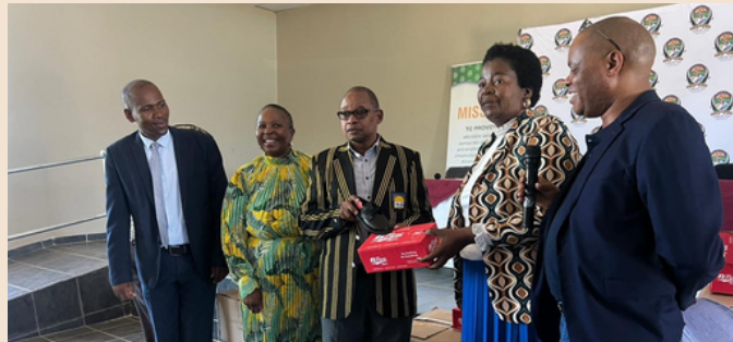
BACK TO SCHOOL CAMPAIGN